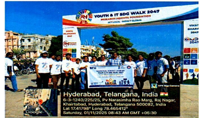
“SDG Walk 2047: Youth shaping the tech-driven future.”