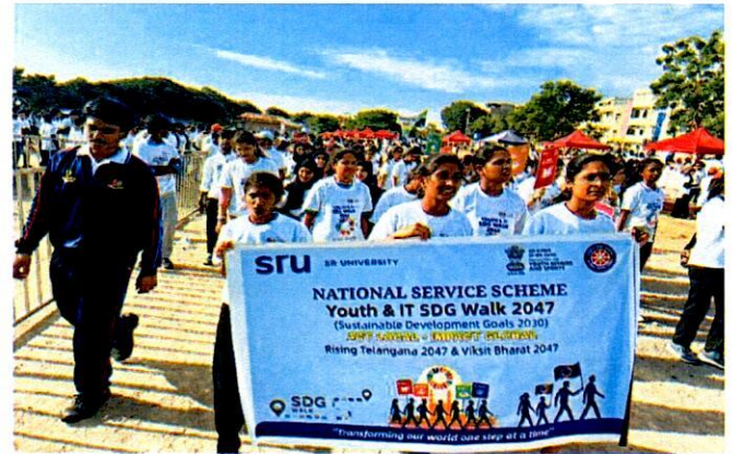
“Steps today for a sustainable, tech-empowered tomorrow.”