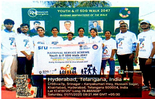
“Empowering youth through technology to build a sustainable India by 2047”